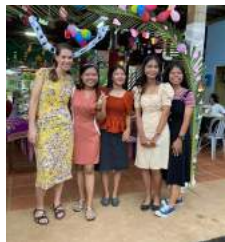
Chelsea w/ Plas Prai Staff