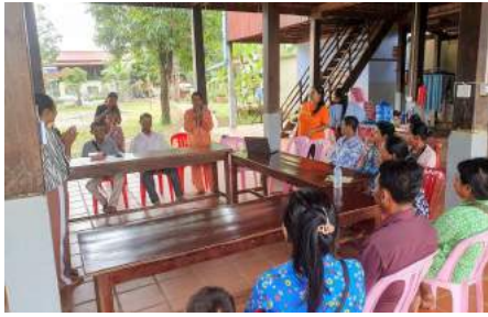
New Believers Meeting at Ministry Learning Center