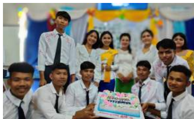
Graduating Seniors—Plas Prai Nov 2023