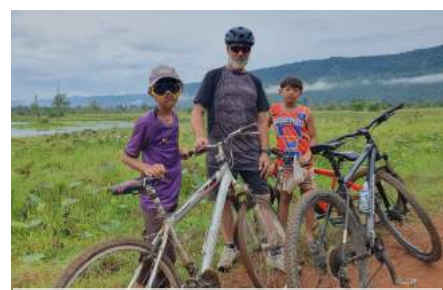
An early morning bike ride with Reach and Dan