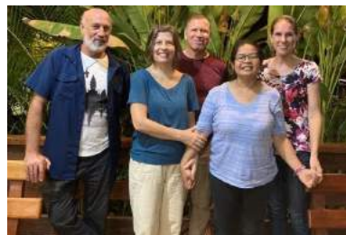
Our Preah Vihear Team 2023