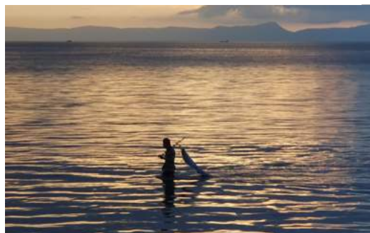
Lonely fisherman hauling in his nets, Kep—November '23