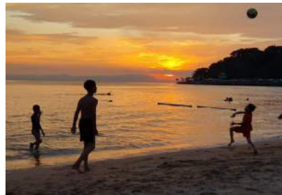
At the beach at Kep with Plas Prai students