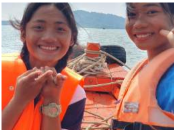
The incoming seniors enjoyed the beach