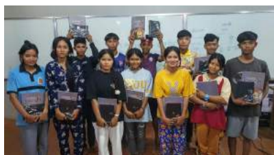
New 10th Grade students at Plas Prai

And yet we know that our Lord is still sovereign, and although “...the nations rage, and the people plot...” (Psalm 2:1), the Truth still stands — Psalm 47:8 – 9 ~ “ God reigns over the nations; God sits on His holy throne. ” Psalm 103:9 ~ “ The LORD has established His throne in heaven, and His kingdom rules over all. ” The world was