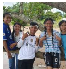
Plas Prai Community Life