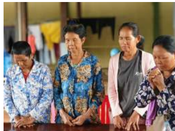
4 Aunties at New Believers' Meeting