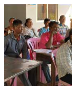
Students learning new skills