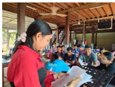
Inductive Bible Study Training January 2024