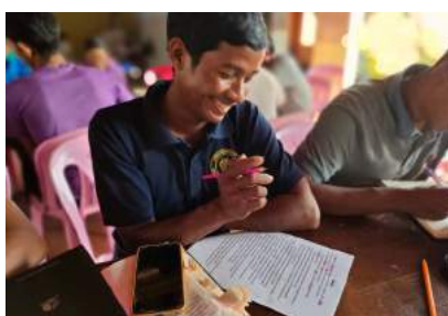
A student at Inductive Bible Study training