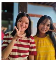
Two of our students