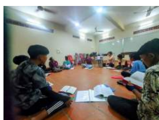
Firm Foundations study Grade 10