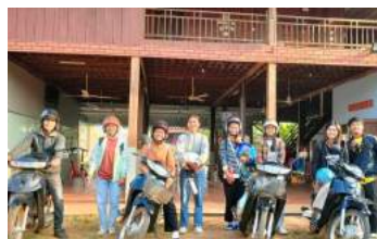
The new Church Planting team Feb 2024