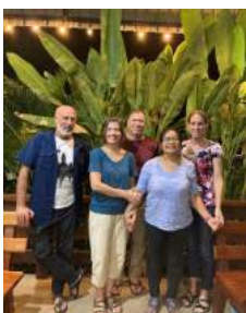
PV Team 2023