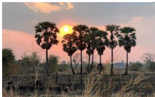
Dry Season Sunset towards Mount Tbeng