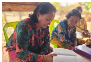
Saphoeur's mother studying at home church