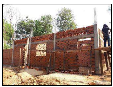
Side view of the new building—classrooms, library and counseling room.

We have finalized the project expenses now that we and the builder have a better feel for the costs at this time. It appears we have 75% of the needed funds. An additional $27,000 will bring the building to completion. We are super excited to get the students in and give some elbow room to the various activities on site, lay out our library and put donated books into place, as well as have a dedicated counseling/one-on-meeting room