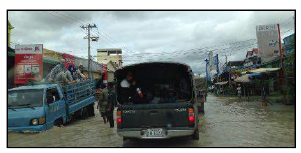
This year, flooding hit Cambodia hard. Thankfully, the Plas Prai Center remained above water. But, we experienced the flood waters on our way home from the beach with our entering senior class.