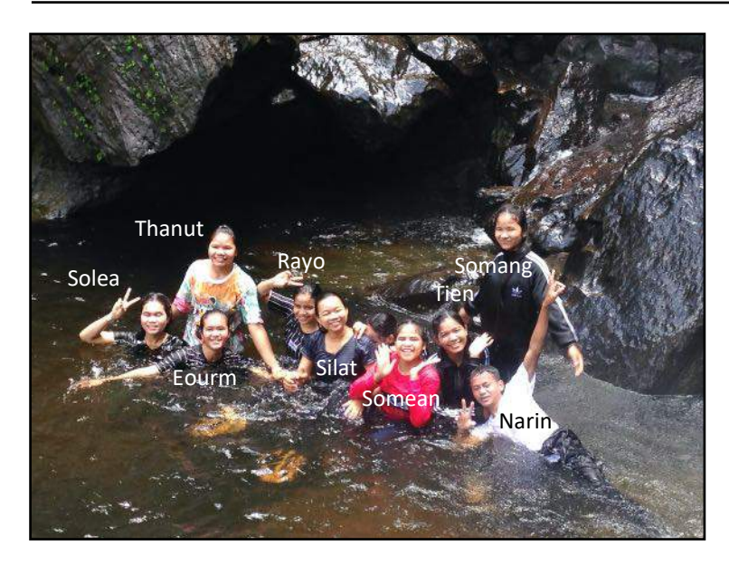
Fun at the waterfall!